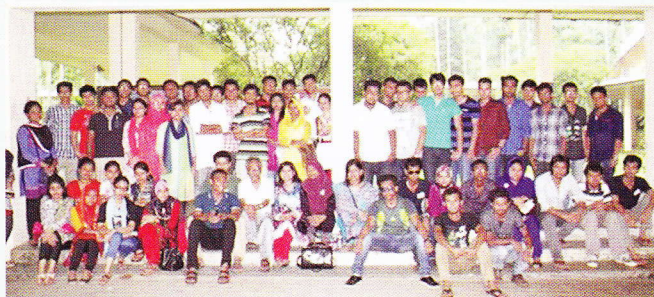
All students and faculty members in survey

field site-a village named "Barai" in Laksam Upazilla. They collected information from 85 households selected by students using simple random sampling based on the existent sampling frame of the village. This survey gave them hands on experience in data collection process. The next step of this survey is to analyse the data and publish a monograph.