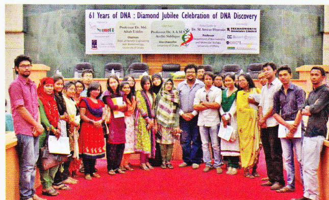
GEB at DU Diamond Jubilee