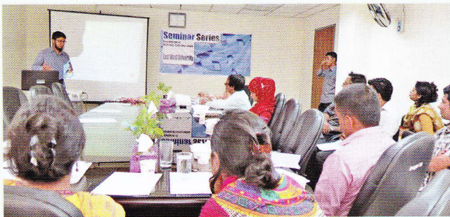
Seminar on "An Alternative Investigation of Weak Form efficiency in Dhaka Stock Exchange Based on Technical Analysis" organized by Department of Business Administration