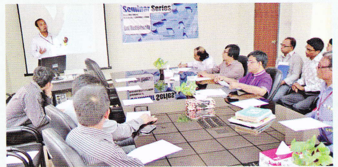
Seminar on 'SME can play key role for enhancing D-8 Countries', organized by Department of Business Administration