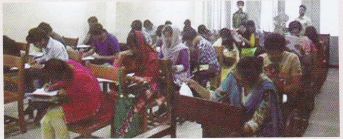
Training Program for the Computer Programmers

EWU Computer Programming Club organized a quiz competition titled "Computer Programming and Information Technology" for students who enrolled in Spring 2014 Semester at EWU. Through this competition students were given an opportunity to explore their strengths and weaknesses in addressing logical, analytical and programming problems so that they may be able to plan properly their forthcoming journey into the domain of computer programming.