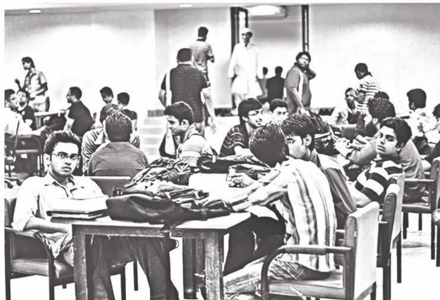
Universities in Bangladesh should take initiatives to revitalise their education system and adopt modern teaching and learning methods.

On the other hand, taking the time to explain how the process works at the university can also be extremely helpful. Giving new students access to a financial aid counsellor can be a big help since besides having the courses they want, students and their families are always anxious about the payment of tuition/other fees. Often, all they need during orientation is reassurance. They might not need all the answers right on the orientation day, but just being empathetic, listening, helping, and giving as much information as a university can will make