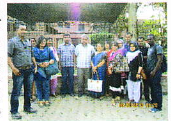
The MPRHGD students and faculties with officials of GSK during their field visit