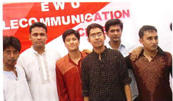
Members of the club in their stall during the Pahela Baishakh fair in the University.