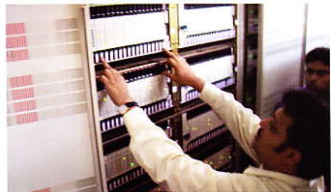
Members of the club inspecting switching equipment during their visit to the Uttara Exchange of BTTB.