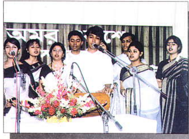
Artists rendering songs in the Ekushey Cultural Programme.

The EWU Cultural Club organised a programme on 27 February 2001 to commemorate the great sacrifices of the language martyrs of 1952.