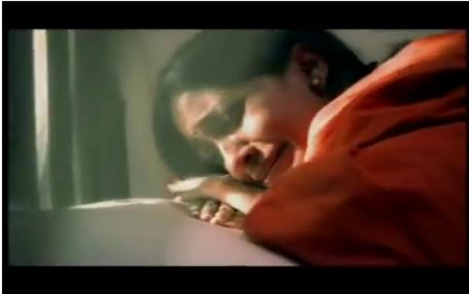
Fair & Lovely Ad:Scene 3

Now, after seeing this ad what girls of both upper and lower class will think? They will think that education is not enough to get a good job, for that girls should have a fair complexion-good figure with high dressing sense. But, what is noticeable is that, if all these