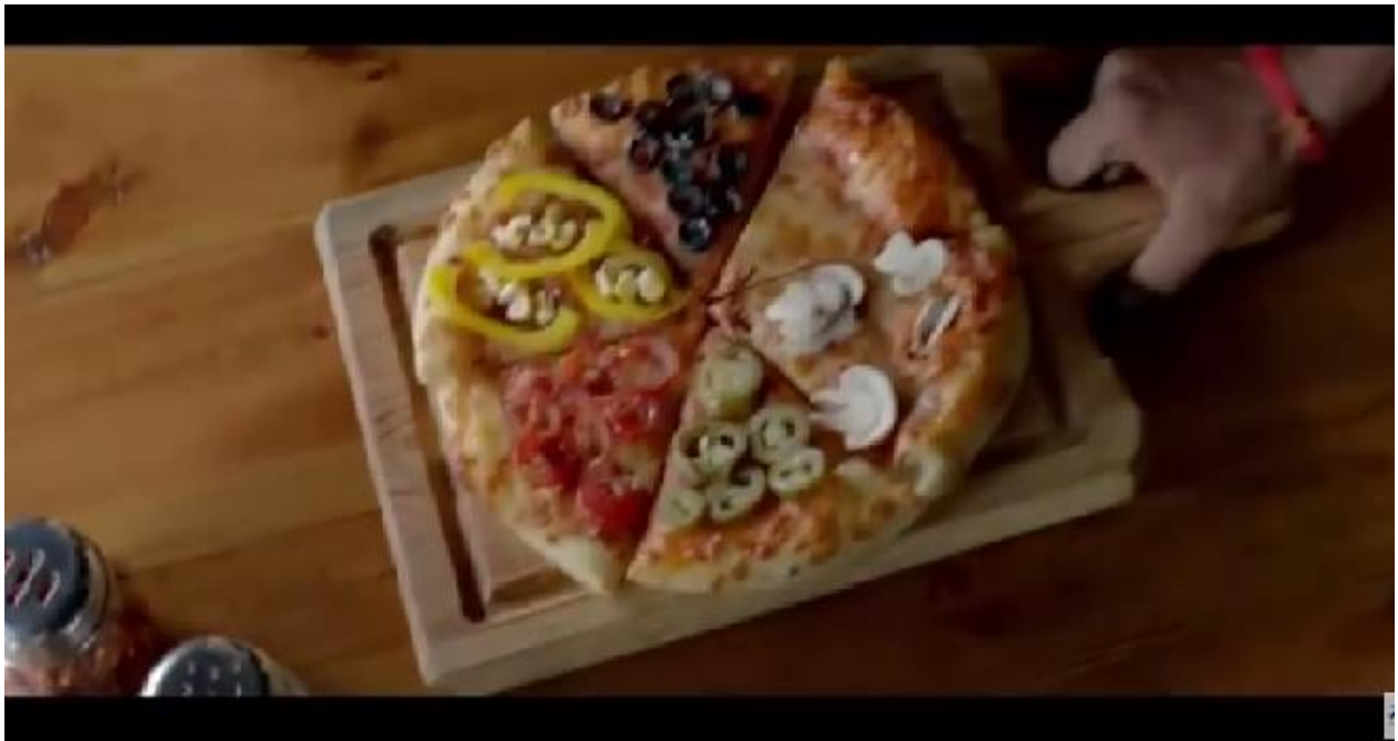
Airtel Ad: Scene 3