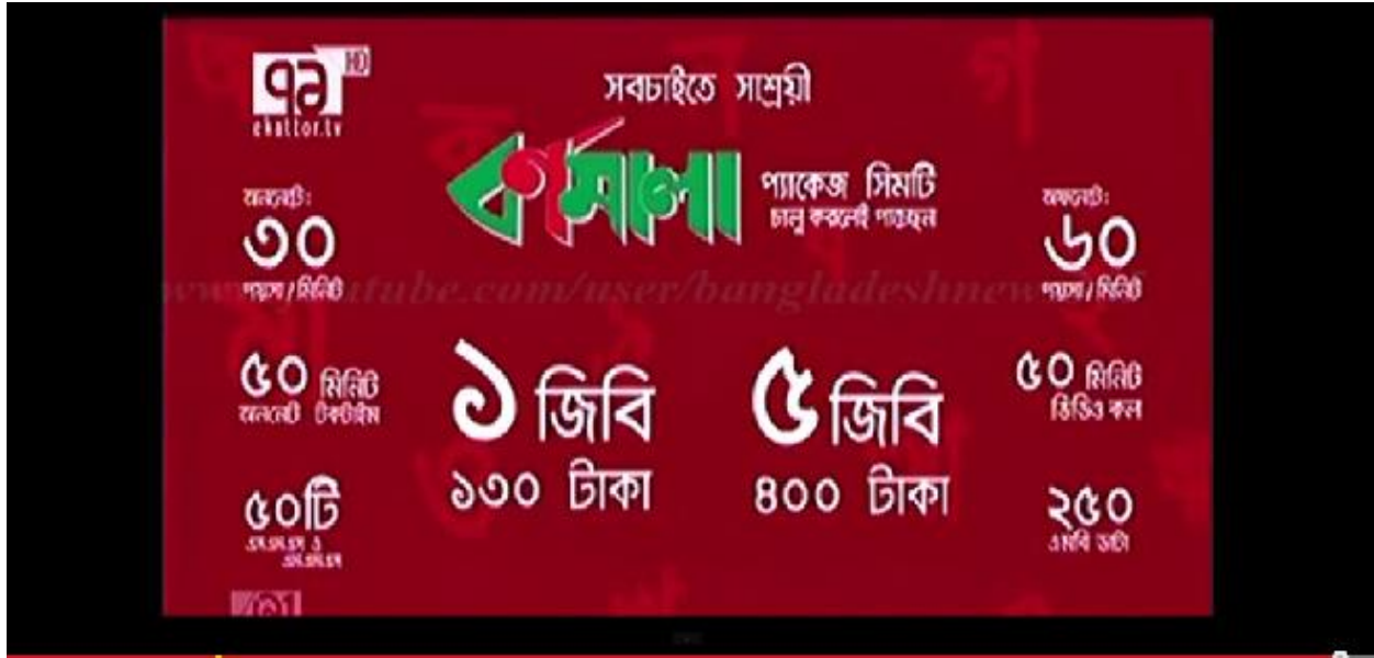
Teletalk Ad: Scene 4

From the analysis of the ads it is clear that there is an invisible battle going on in these advertisement or media world. Everyone is fighting desperately to make their position in this field of glamour- popularity-competition-truth-fakeness. Everyone desperately tries to show that their products are best-flawless-and for everyone from every backgrounds-age-gender-class-etc. In this field, language plays the most important-influential role, who help the ad makers, the companies to transmit their messages and information about their products to the consumers-viewers-to the main masters who will judge all the products and on the basis of their own demands-needs-choices-state of minds, they will decide that whether they will buy a particular product or not. According to Richard T. Schaefer (2002) “Language is in fact, the foundation of every culture. Language is an abstract system of word meanings and symbols for all aspects of culture. It includes speech, written characters, numerals, symbols and nonverbal gestures and expression”. He also claims that “Language is the foundation of every culture and the ability to