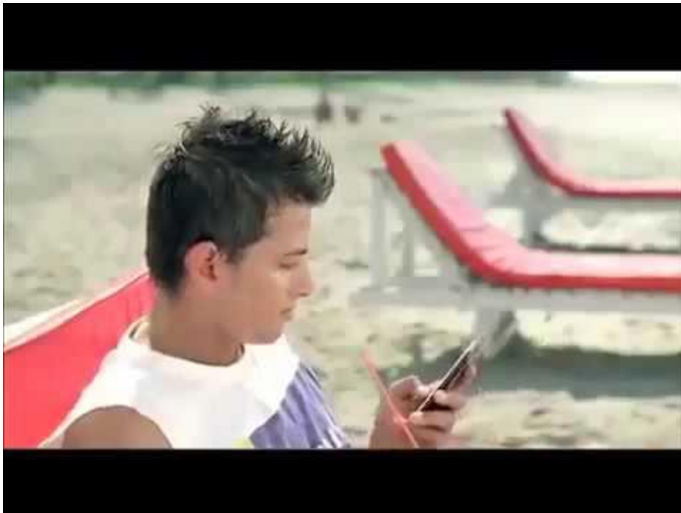
Airtel Ad: Scene 3