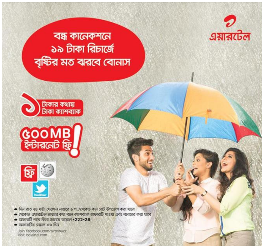
Airtel Ad: Scene 5