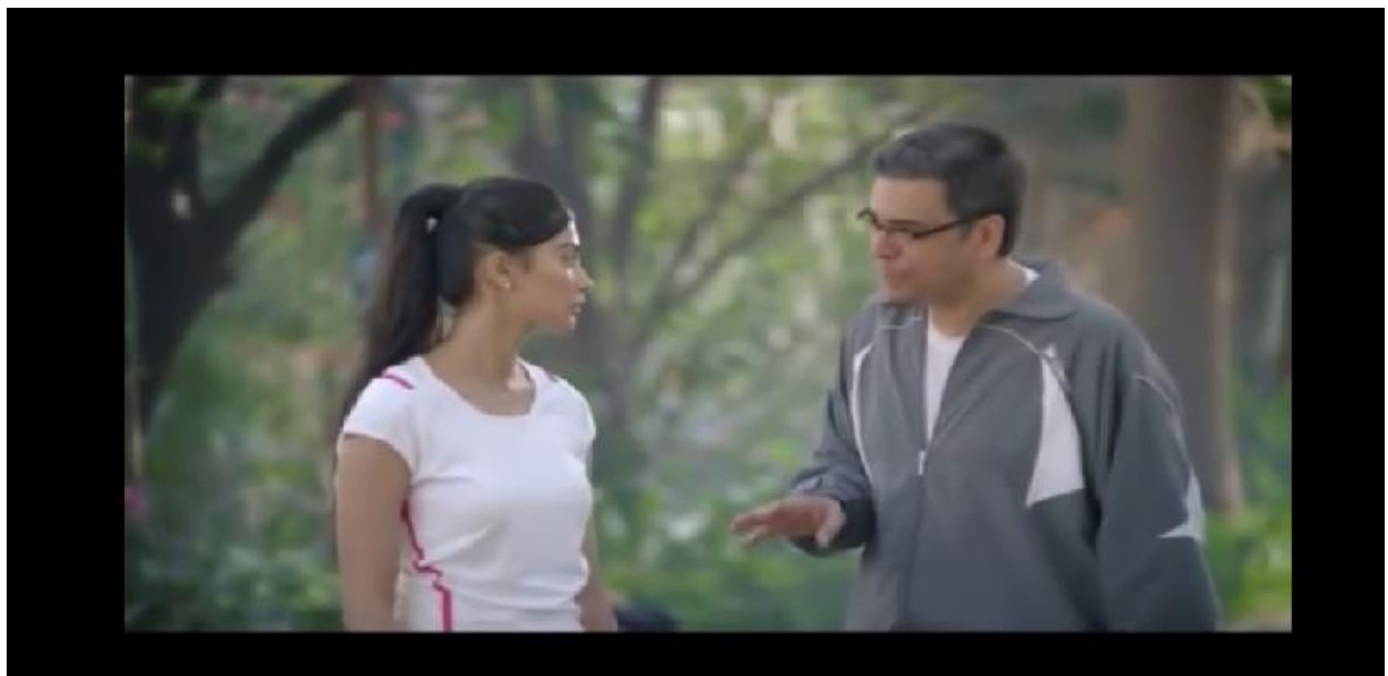
Fair & Lovely Ad: Scene 2