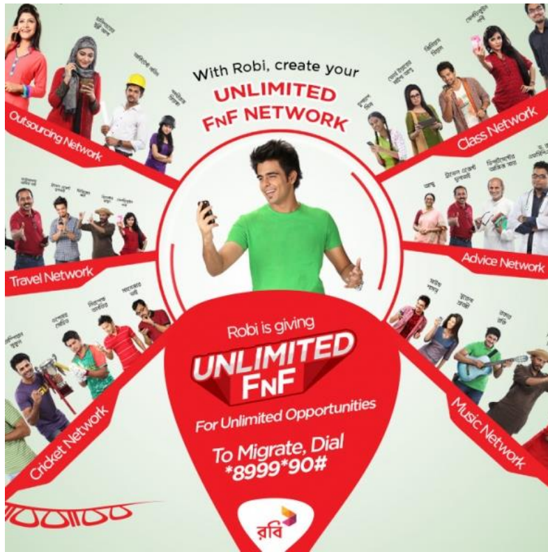
Robi Ad: Scene 2