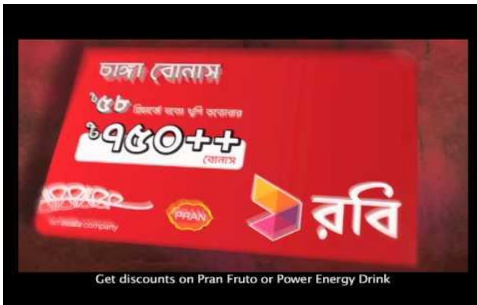
Robi Ad: Scene 1

The ad shows that everything diminishes after a certain period but Robi is providing unlimited bonus in talk time, SMS, internet if the customer activates his/ her deactivated Robi SIM. This ad uses hyperbole to show the extravaganza of bonus in Robi network with the support of the adjective ‘unlimited. The customer will get the unlimited service if they return to the mobile network. This ad also shows signs of numerous social sites and says that the customer will have more lifelong bonuses which in reality cannot be happened. The unlimited use of internet, specially using the socials sites is increasing day by day just because of some service the mobile network company offers. Like in this advertisement, Robi is providing unlimited bonuses in call service, sms, and internet as well. People when heard about the offers do not think about the reality just tries to take the service just for the lower rate.