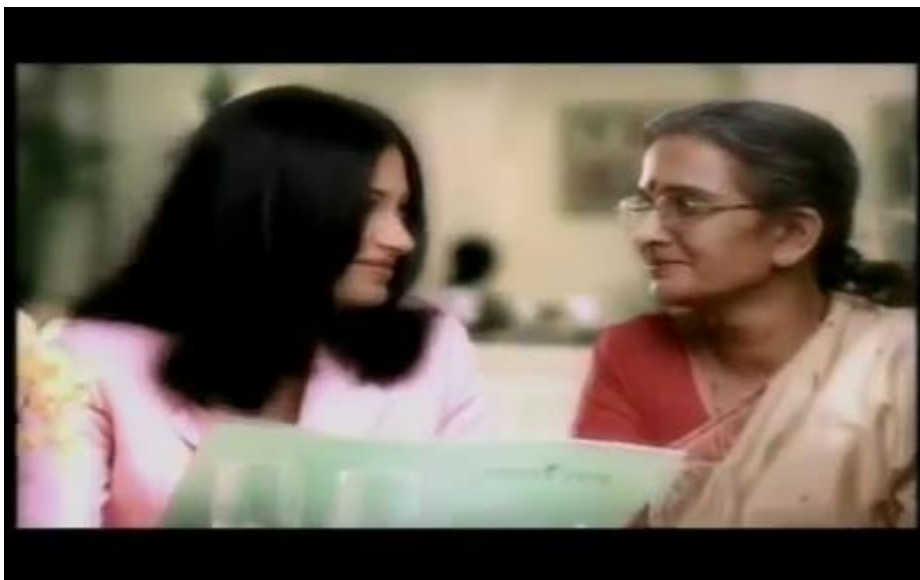
Fair & Lovely Ad: Scene 7