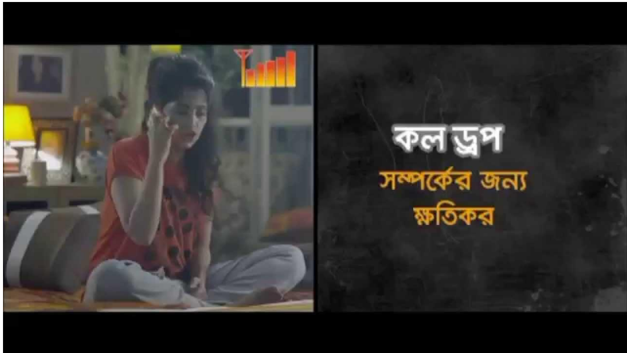
Banglalink Ad: Scene 4 Banglalink Ad: Scene 5