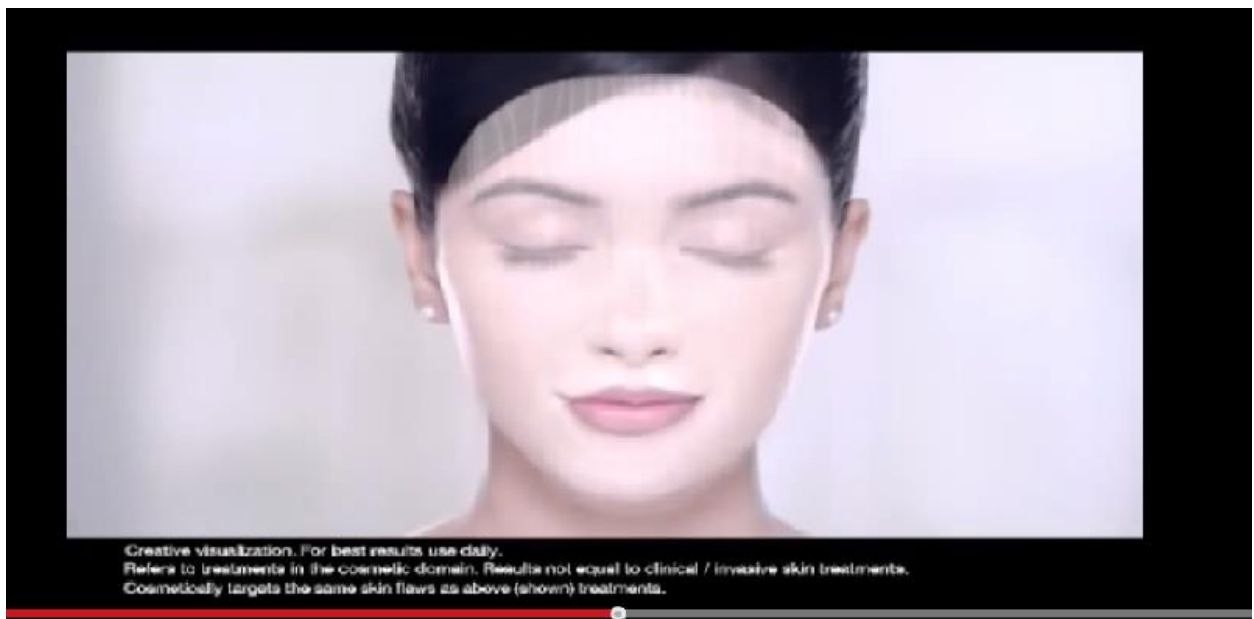
Fair & Lovely Ad: Scene 7