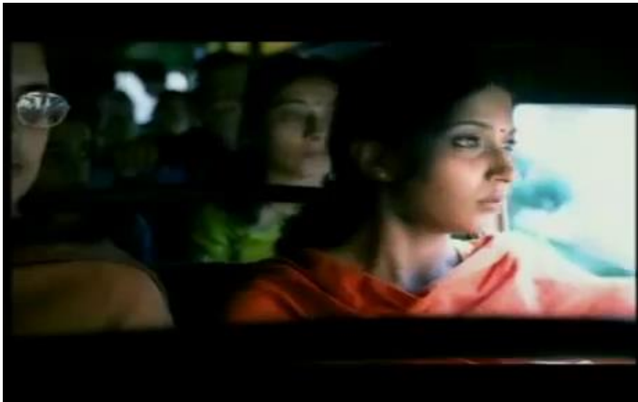
Fair & Lovely Ad: Scene 1

In one advertisement of Fair and Lovely, it is seen that- a girl dressed in a simple-ordinary-middle class manner goes for an interview. From her gestures and facial expressions, it is clearly seen that the girl is not at all confident about her own look and personality. And when she enters into the interview room, all the board members give a look that seems very weird and peculiar that they are not interested. By seeing the girl as she has a dark complexion and also her dressing sense are not so attractive. Without even seeing her certificates they all rejected her and one of the senior boss says, “She will not get the job”.