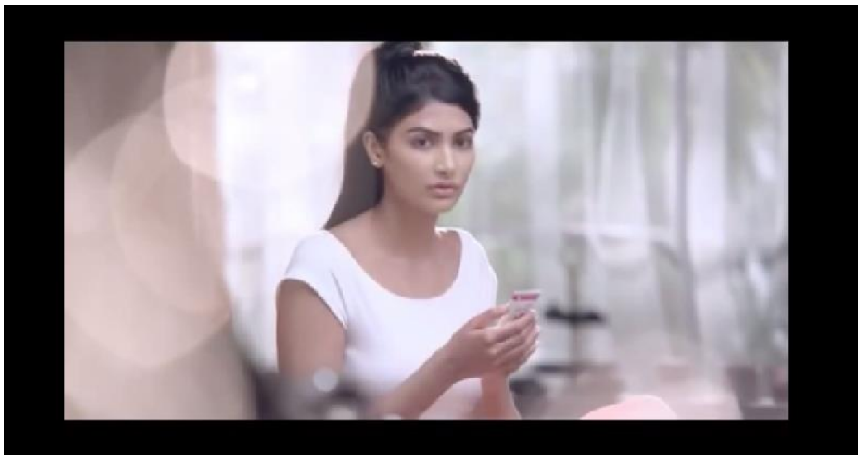
Fair & Lovely Ad: Scene 6