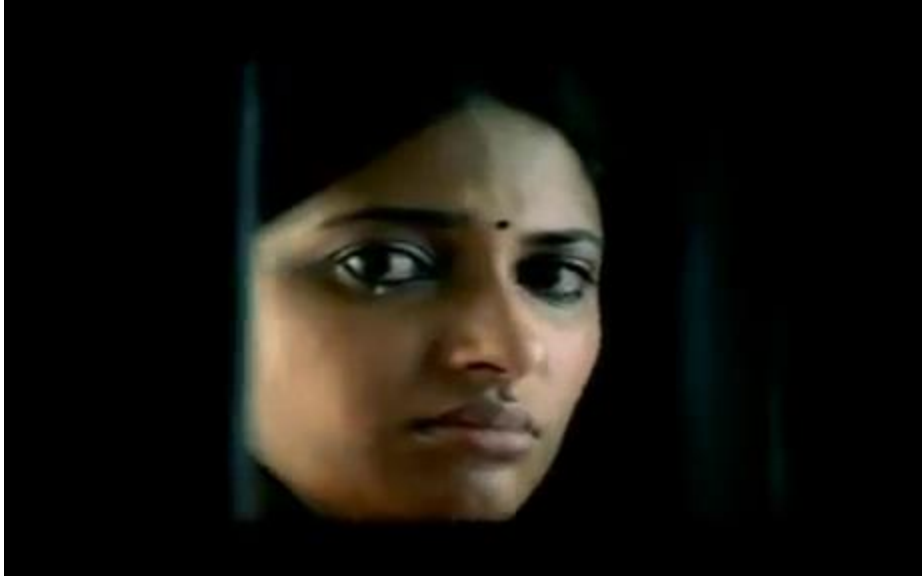
Fair & Lovely Ad:Scene 2