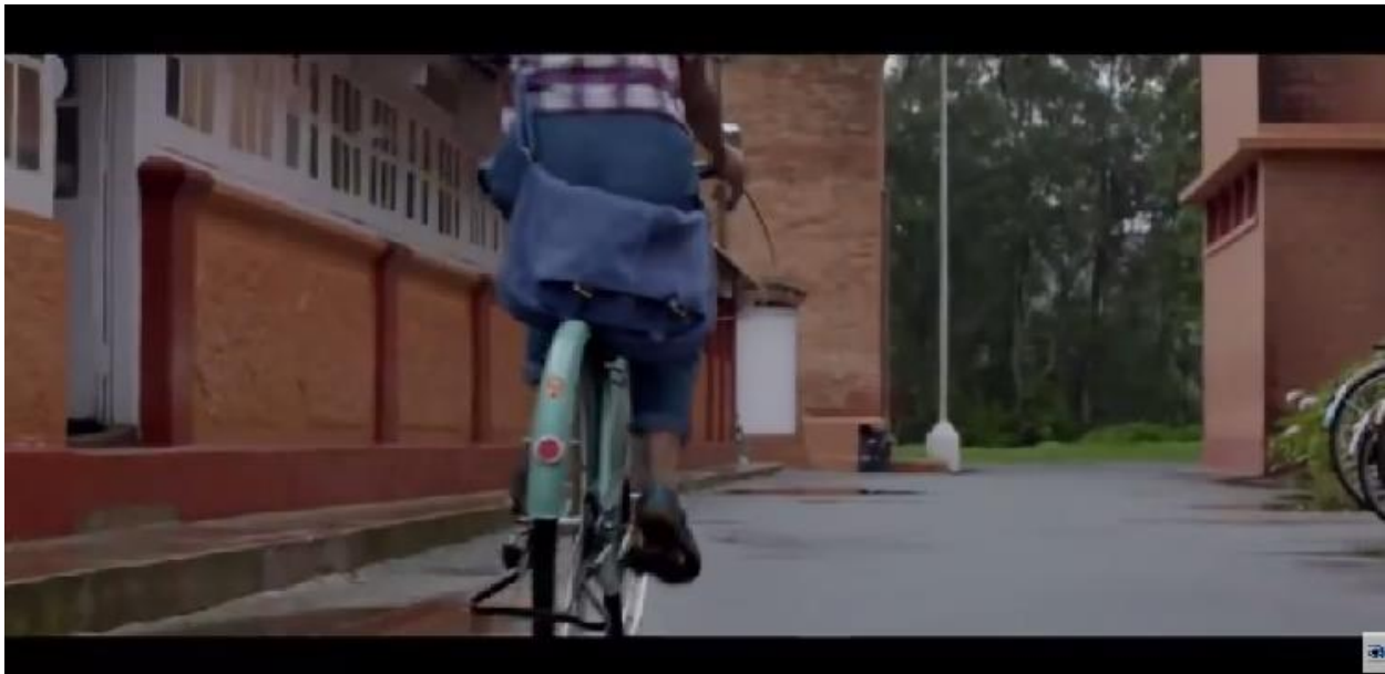
Airtel Ad: Scene 1

'BondhuGarage' young people are more concerned with lifestyle, especially , food, clothes, make-ups etc.it shows art and games but not of this country as the ad shows a person playing basketball, another in a band, practicing with new version of guitar. All these again portrays again a certain class of people and the target consumer, young generation are seen busy with fun and entertainment. The 'Cool' factor is more important and doing unique and unusual things are 'Cool'. The overt message the ad gives here is though the people shown there have different taste, they are equal in the friendship. In Airtel they all are getting the same service at same price. The influence of western culture is also noticeable here in this ad.