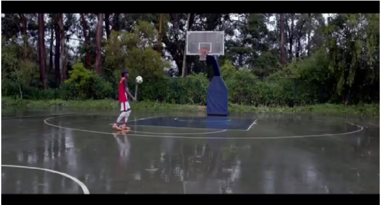
Airtel Ad: Scene 4