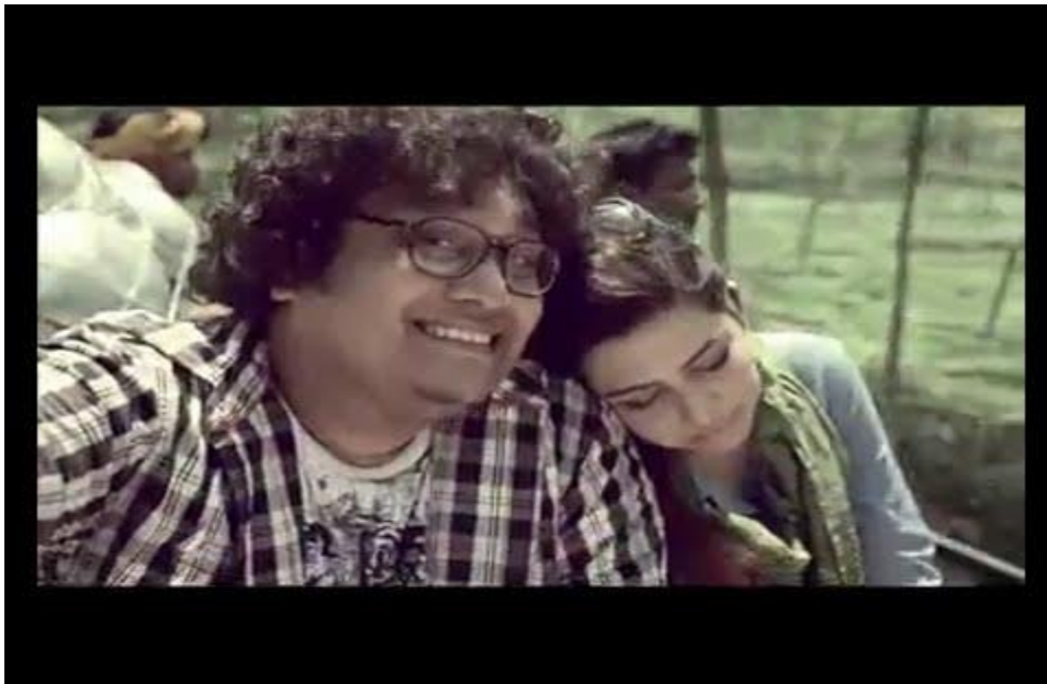
Airtel Ad: Scene 1

In the ad a group of friends shown and one of the friends wants to help an unknown girl as she stands alone beside the street. To help the girl he leaves his friends. Eventually they reach the station from where they can continue their further journey but the girl meets her lover there and leaves the boy who helped her to reach the station. All through the journey the boy was posting status updates in social site. For this reasons his friends find him again in the station. The ad conveys the meaning that if you leave Airtel as they claims that “you will be out of network”, so Airtel provides the customers strong mobile network with which the customer can be connected with their friends all the time. This ad also says about good connection of Airtel and also the benefits of internet because it connects one with his/her friends all the time. The use of internet is also noticeable, the boy uploads picture and posts the status of the places he moves with the girl. Uploading the picture of the girl sleeping onto the boys shoulder shows the abuse of internet.