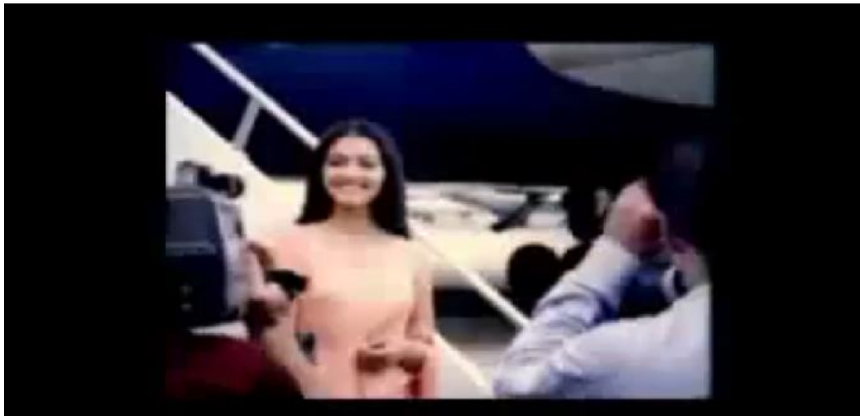
Fair & Lovely Ad: Scene 4