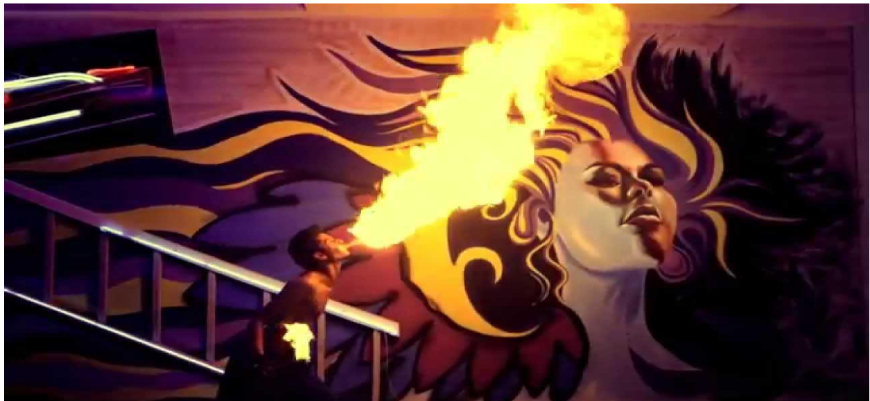
Grameen Phone Ad: Scene 2