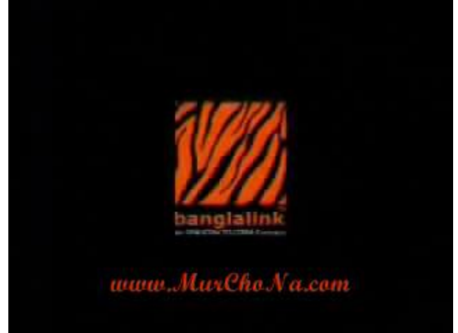
Banglalink Ad: Scene 4

If we compare the telecommunication ads of Bangladesh then we can see that most of them are promoting an environment auguring well for the sense of independence. Individual independence and Self-establishment is also articulated through current advertisements. As already said, individual independence, success, reticence and other individualistic characteristics in advertisements convey a sense of personal freedom. Without language the whole idea of advertisements is vague and useless because an ad cannot convey the exact messages only by using music, expressions, backgrounds and dance movements; to show or promote one's business strategies one must have to use effective and attractive words or in other word right use of correct languages in appropriate situation.