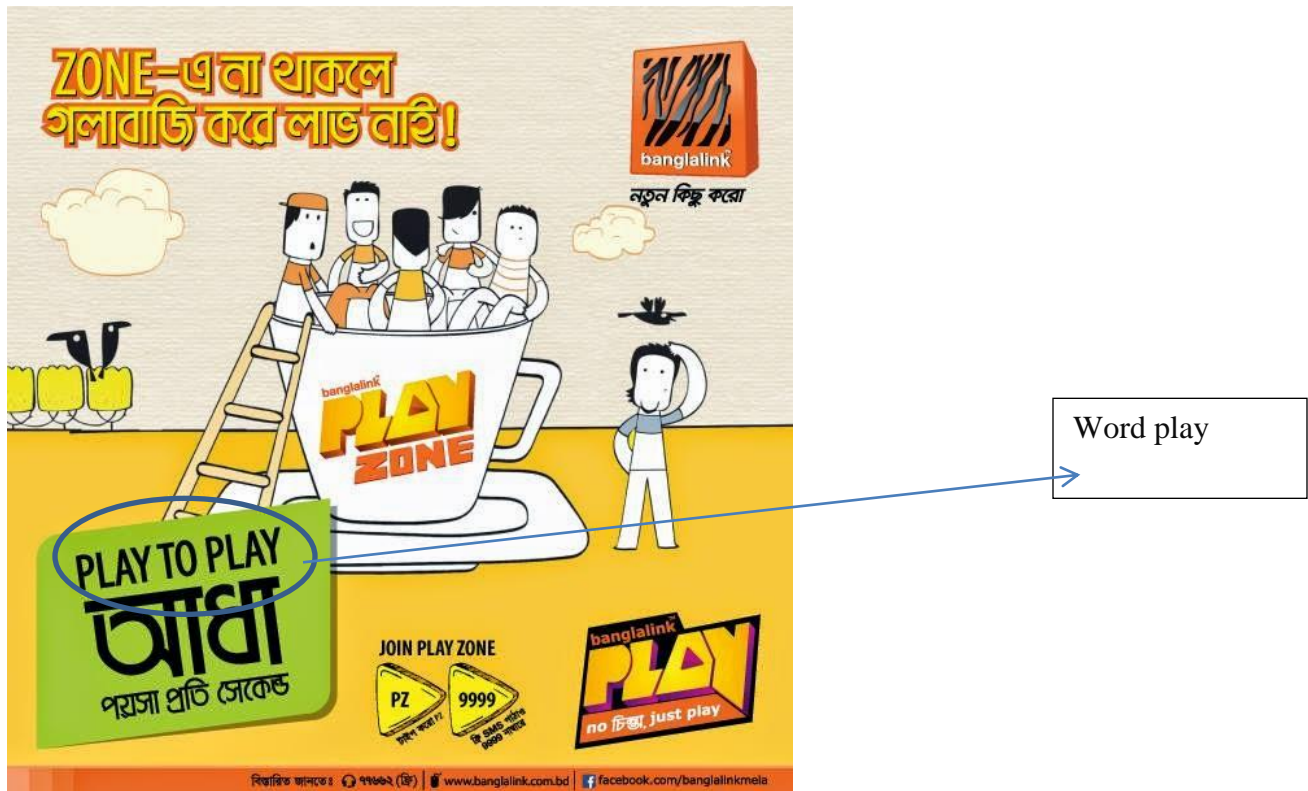
Example-6: Word play

Playing with words is another significant feature of the advertisements. To grab the attention of the audience the creative writers try to input some new things in the ad. The words with different formation please the audience. It also serves the purpose of achieving attention of the customer as advertisement is also entertaining.