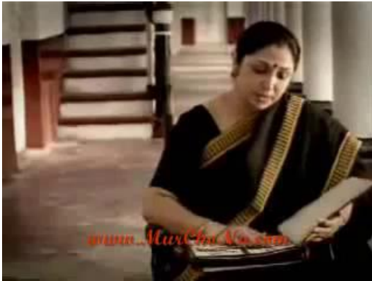
Banglalink Ad: Scene 1

Sometimes advertisements can claim logically or claim on products' supremacy that the ads propose to correspond comparatively longer and transmit to the deep-set human feelings like nationalism, fraternal longing and warmth, independence etc. For example, an ad-clip of Banglalink shows a middle aged woman mourning over the faded memory of her younger brother, with his photograph in her hand, whom she left beyond a river bank, in a dark night, in the rush days of the Independence War in 1971. A message of commiseration goes for all such pained souls losing their dear ones in the liberation war. At the very end of the scene, the company name is quietly but clearly pronounced. Again, nothing is said about the product nor anything claimed.