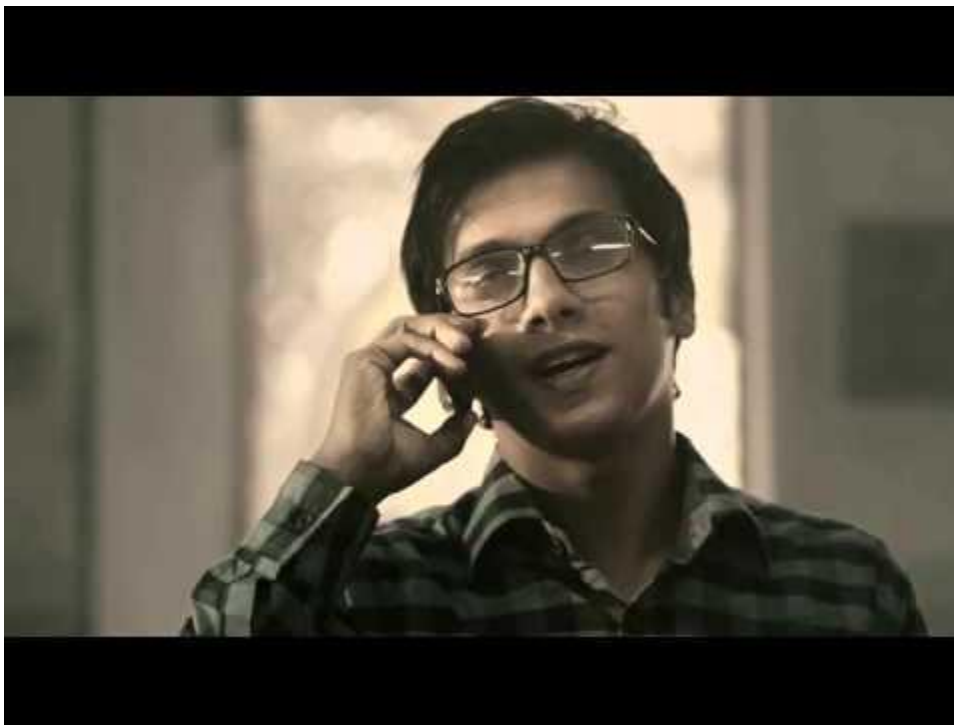
Teletalk Ad: Scene 1

youth were care free, bold and courageous to change their life and lifestyle. They have the power in their hands to rule their destiny but here the middle class boy who is away from his family is scared to speak a word even rather change his life and lifestyle. In the setting, might be the canteen of the student hall, the students sitting around here and there are not much fashionable, not wearing any flamboyant dresses not experimenting with their fashion.