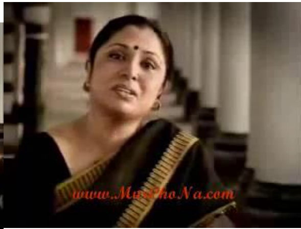
Banglalink Ad: Scene 2