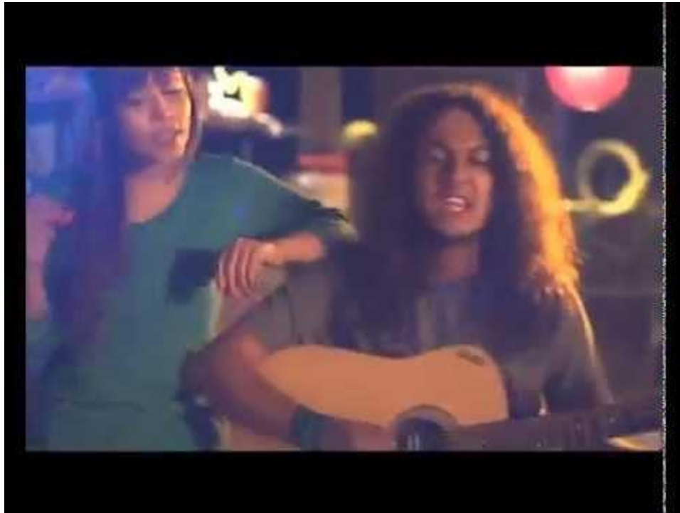
Grameen Phone Ad: Scene 3