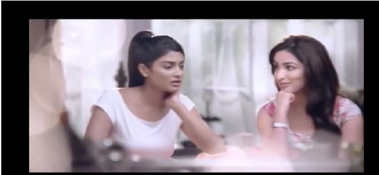
Fair & Lovely Ad: Scene 3