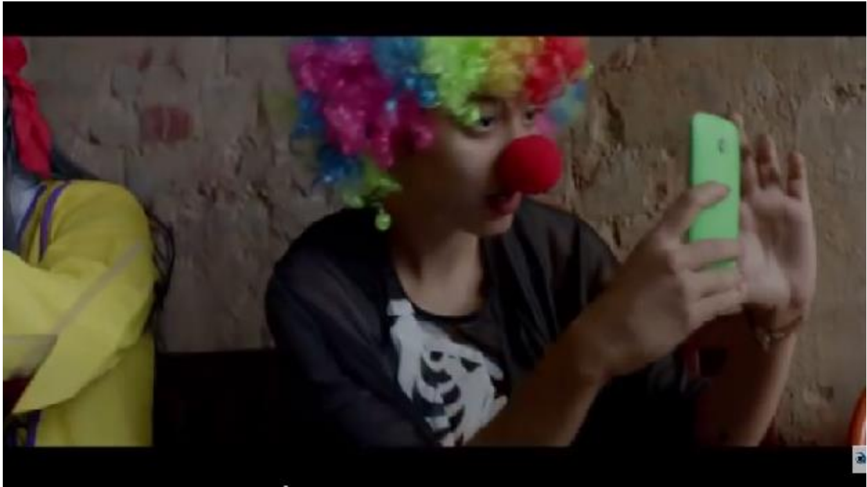
Airtel Ad: Scene 6