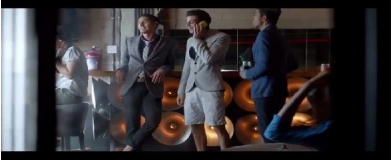
Airtel Ad: Scene 2