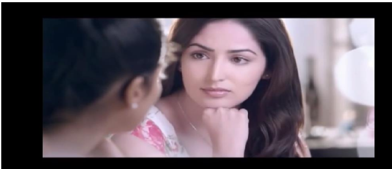
Fair & Lovely Ad: Scene 4