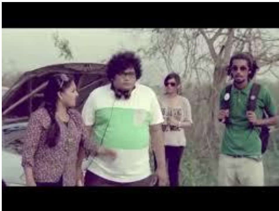
Airtel Ad: Scene 7