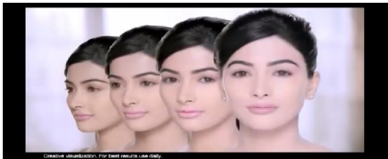
Fair & Lovely Ad: Scene 8