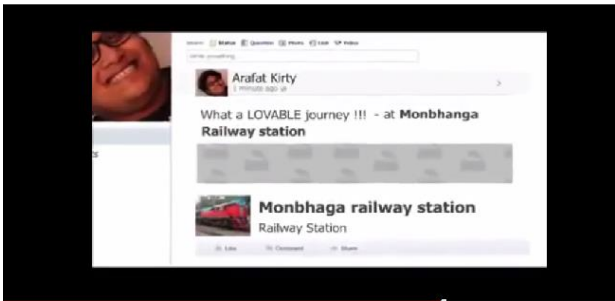
Airtel Ad: Scene 3