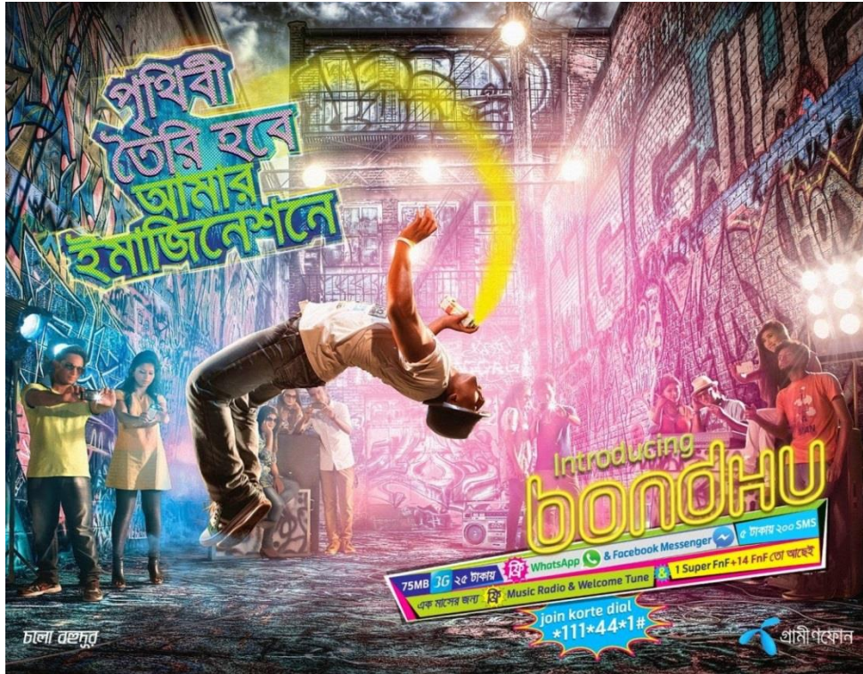
Grameen Phone Ad: Scene 1