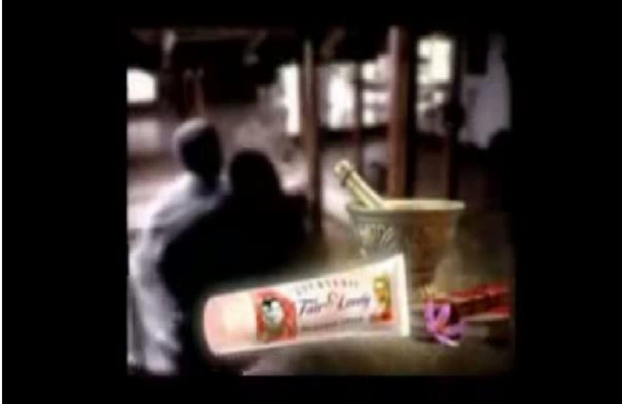
Fair & Lovely Ad: Scene 5

How unethical this can be, that there is no priority of talent, education except fair complexion. Her fate is questioning her and continuously blaming her that, “she is the one at fault for her own bad luck!”