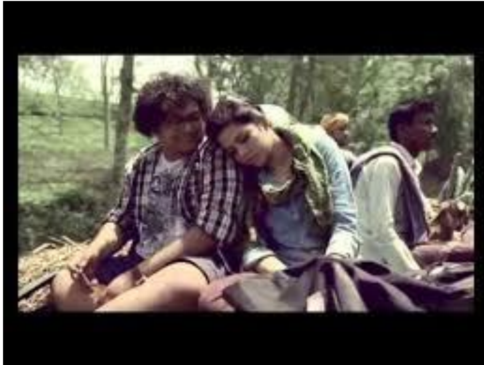
Airtel Ad: Scene 4