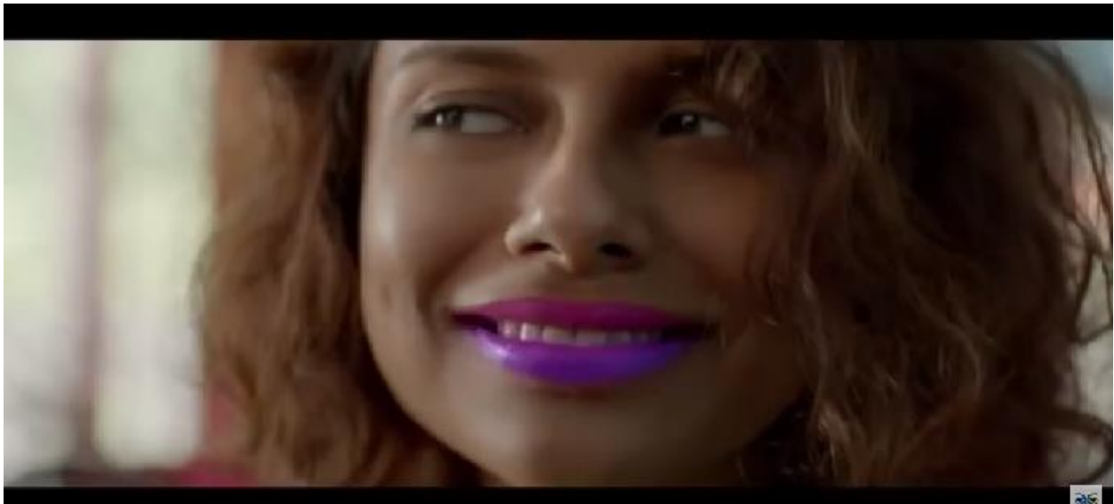
Airtel Ad: Scene 7