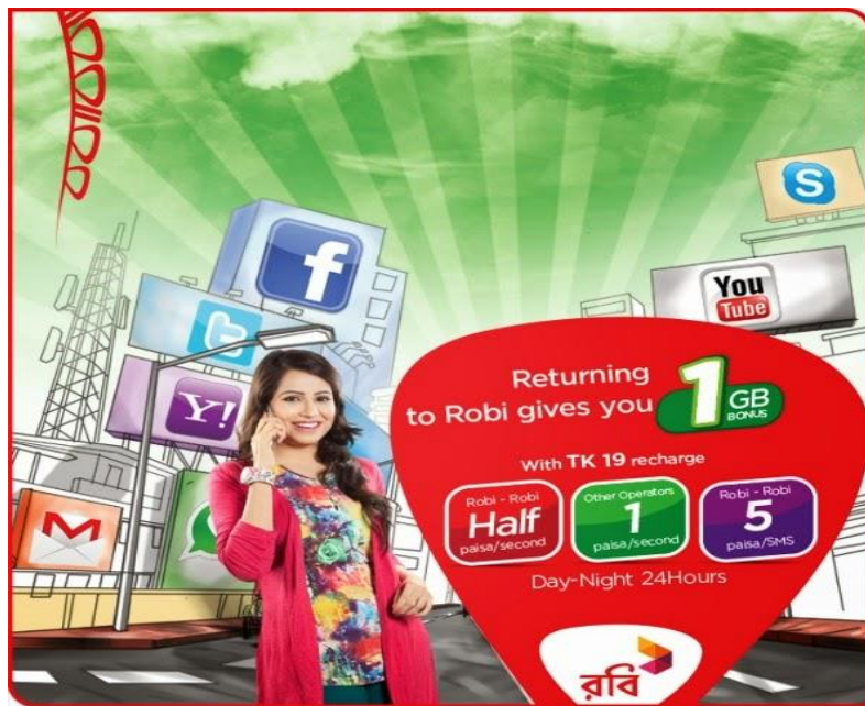
Robi Ad: Scene 3