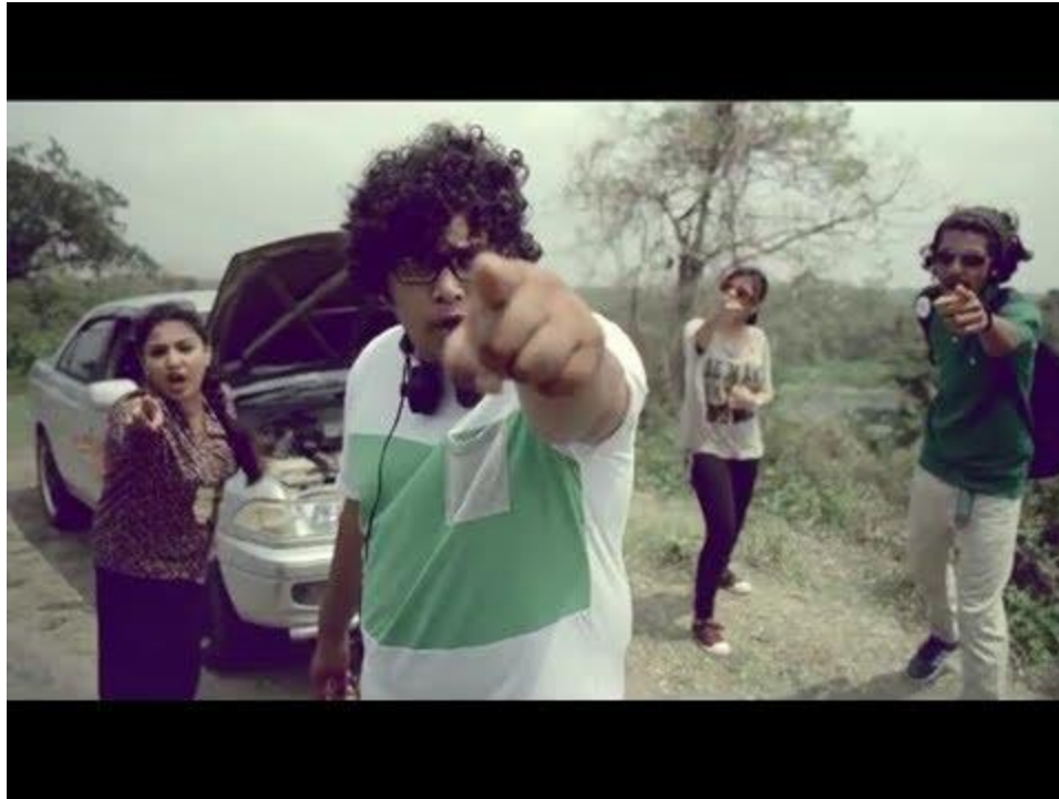
Airtel Ad: Scene 6