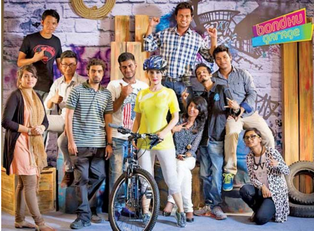
Grameen Phone Ad: Scene 5