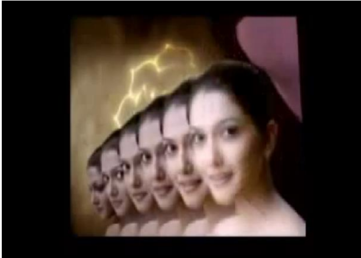
Fair & Lovely Ad: Scene 3