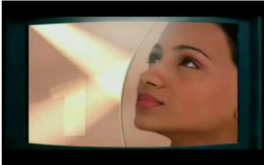
Fair & Lovely Ad:Scene 4