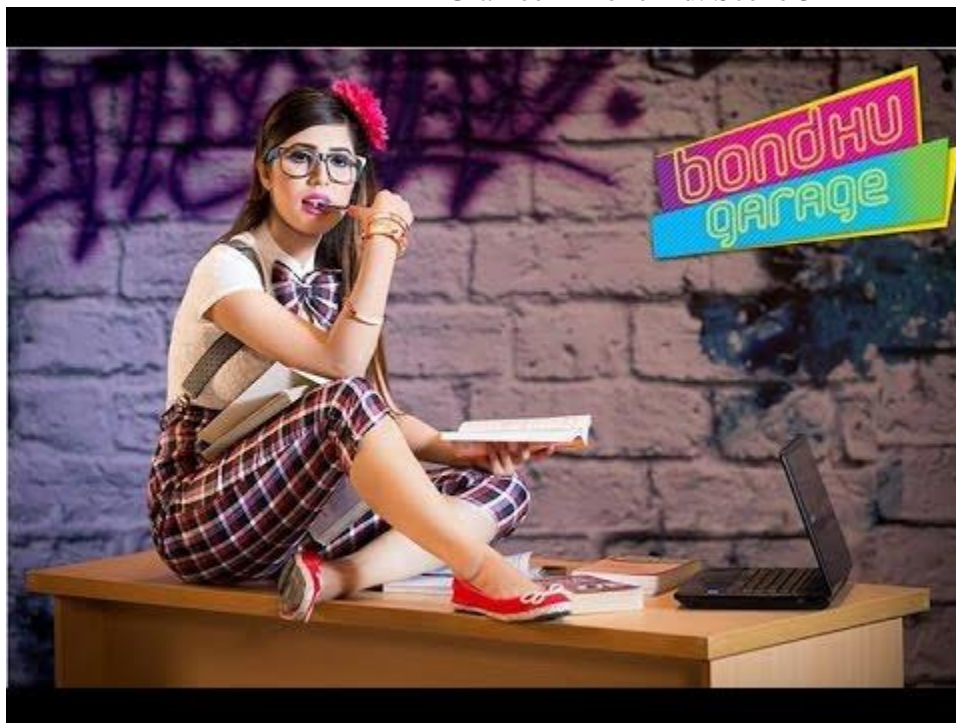
Grameen Phone Ad: Scene 4