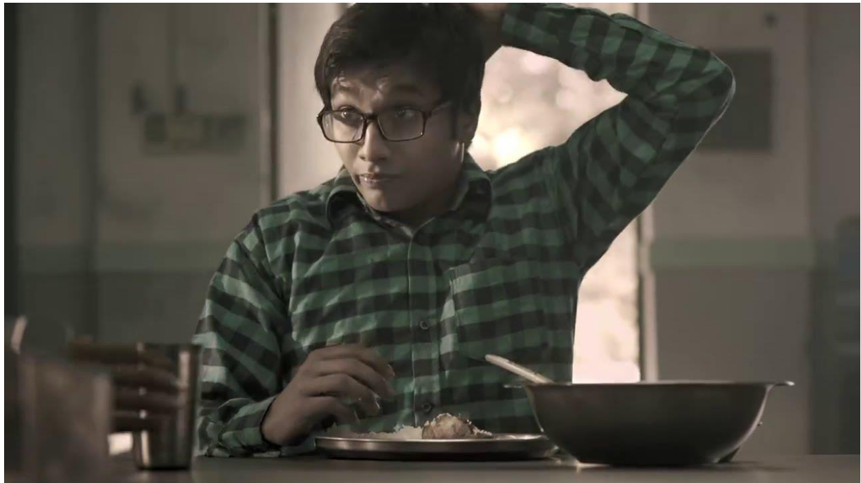
Teletalk Ad: Scene 2