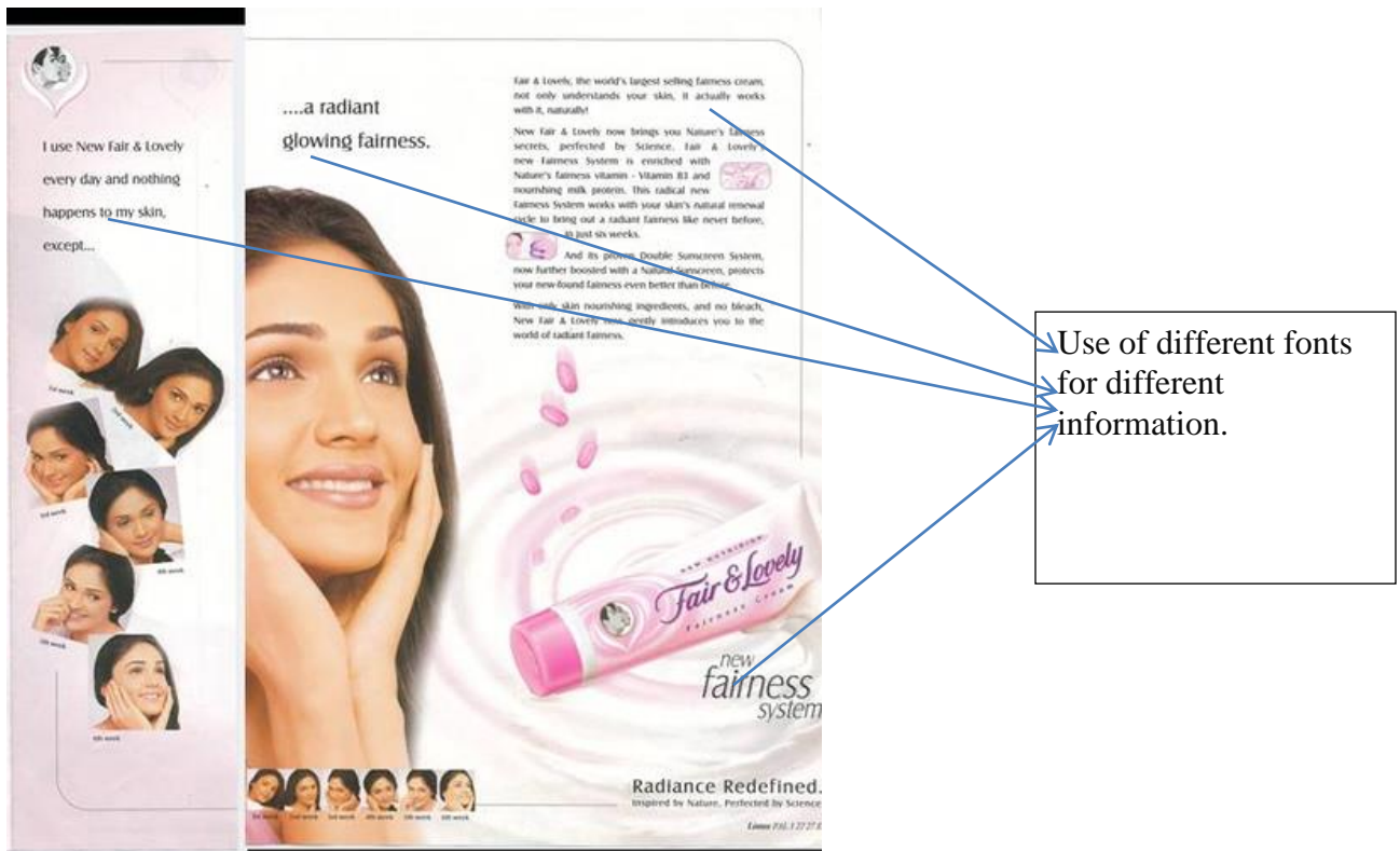
Example-1: Use of different 'Font' as attention seeking device

From the example it can be seen that it has used different font sizes and colors to grasp the attention of the audience. The example also shows that the information regarding the product details, ingredients and manufacture of the product are given in a very small font size that people can hardly read that part. People tend to ignore the information not deliberately but unconsciously, because of the small fonts. The big colored font will attract the people. This is the strategy followed by the ad makers to make the audience not to notice all the written information.