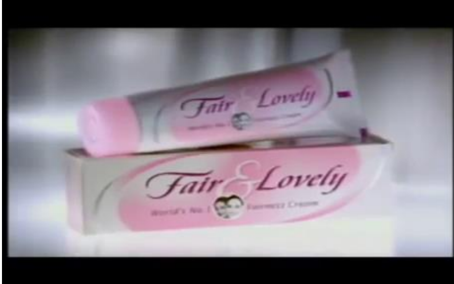
Fair & Lovely Ad: Scene 8

short skirt and shirt- high heels. And in her next interview, only seeing her glowing-smiling face, all the members get stunned and surprised, and immediately offer her the job in a top position. At the end the girl herself admits that fairness cream is so effective that it also boosts her confidence to face any tough situation. In this particular ad, these two highlighted statements actually work as the engine of this ad. These two statements can capture attention of both upper and lower class girls/women-both educated and uneducated ladies can believe this particular ad because of the language that are used here. Language is very eye-catching and related with our socially constructed norms that fair girls are given more importance in every field. Language is at the same time so well chosen and precisely stated that one line statement is enough to convey the main motive of this particular fairness product, and bring a huge profit and popularity in their side.