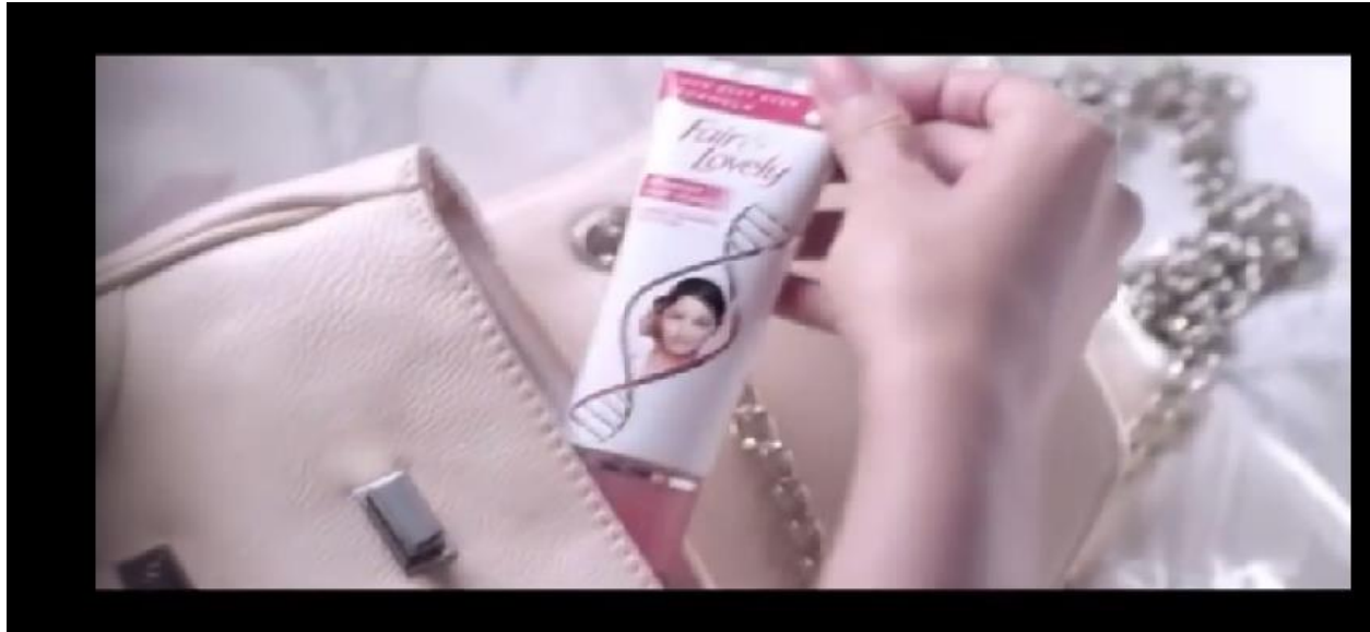
Fair & Lovely Ad: Scene 5