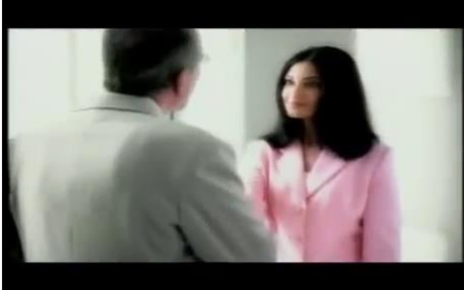
Fair & Lovely Ad:Scene 6