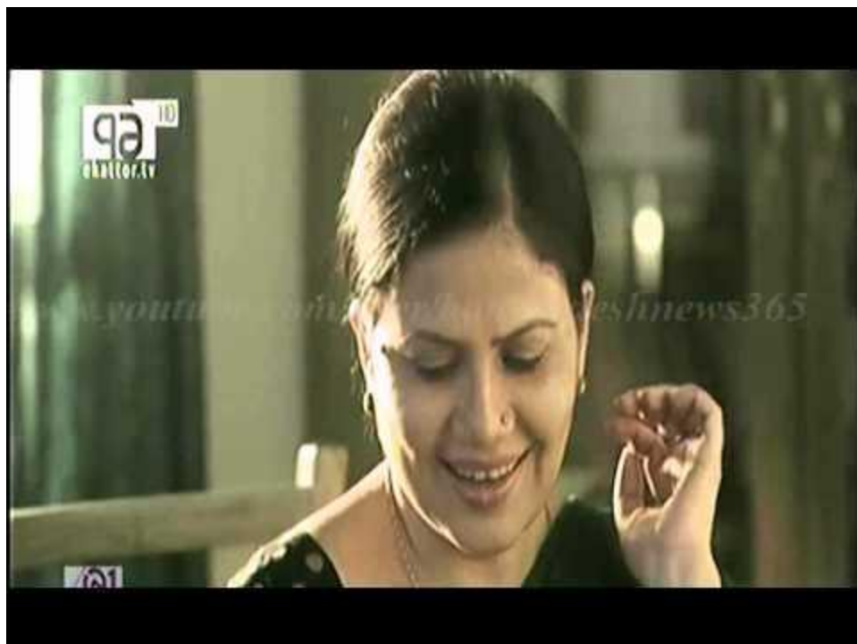
Teletalk Ad: Scene 3