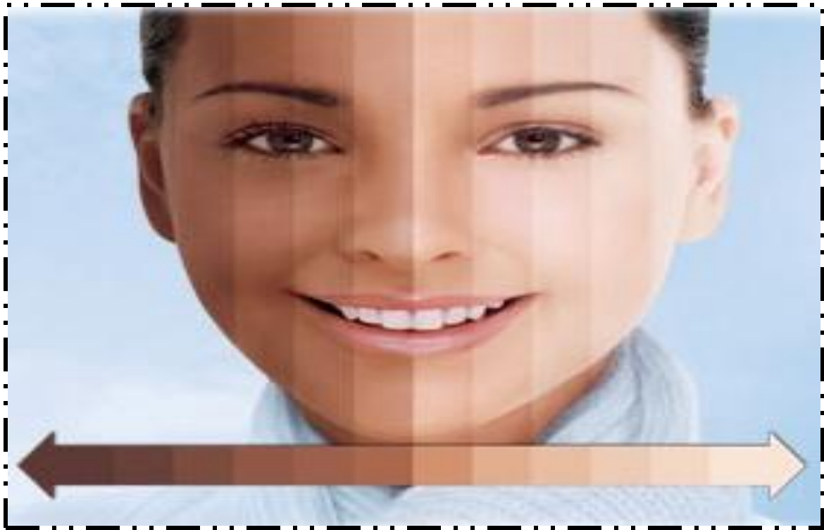
Fair &amp; Lovely Ad: Scene 6

In recent ad of Fair & Lovely they have shown the same thing in a different way. One girl's father is worried about her daughter's marriage. He tries to make her daughter understand to get married and settled in life. Then the daughter's friend suggests that she should first try to get a good job, settle down in life then get married. And the tag line is "use Fair & Lovely and you will get a good job".