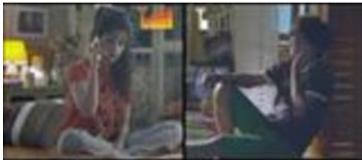
Banglalink Ad: Scene 2