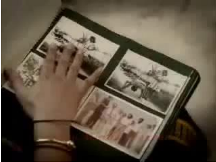
Banglalink Ad: Scene 3