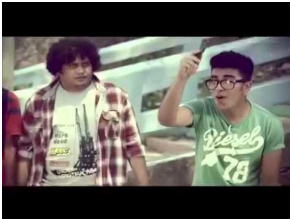
Airtel Ad: Scene 5