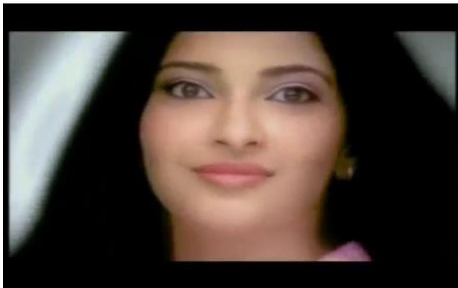
Fair & Lovely Ad:Scene 5