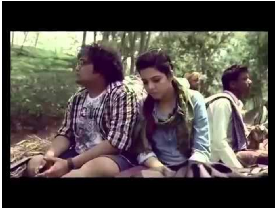
Airtel Ad: Scene 2