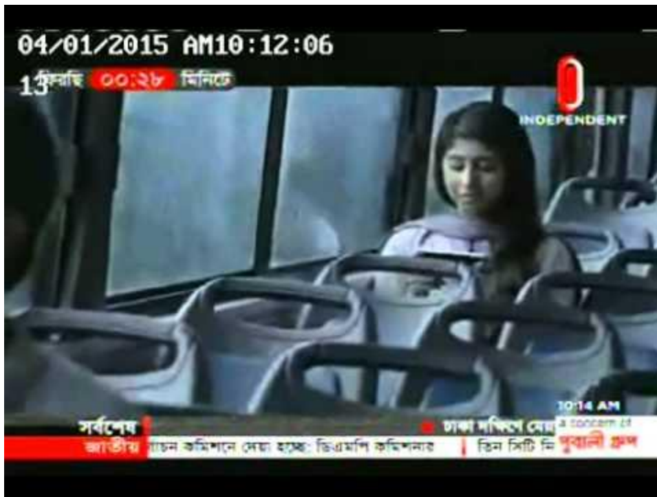
Airtel Ad: Scene 1

The ad is influencing the customers to socialize through different social sites, to use social sites one will be in need of internet connection and Airtel is providing unbeatable internet connection. It shows that one need not communicate with people around him/her verbally rather, there are vast social networking sites in the internet, with the help of which one can be socializing with thousands of people, and they can be friends or can be strangers. The alienation of the modern society is glorified here because each of them are sharing their thought and activities through internet. The usages of internet in this manner and also introducing different sites are making people distracted from real socializing. People talk more in the social networks rather than talking face to face with the family and friends. The use of internet shown here is also influential as they show the number of users of those sites and it is mentioned that the majority of the population of the whole world use those sites, so the customer should be in group of the majority, be in the trend of socialization.