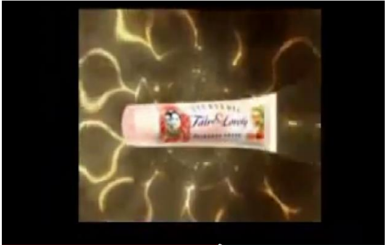
Fair & Lovely Ad: Scene 2