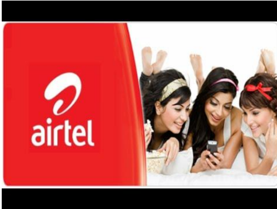
Airtel Ad: Scene 4