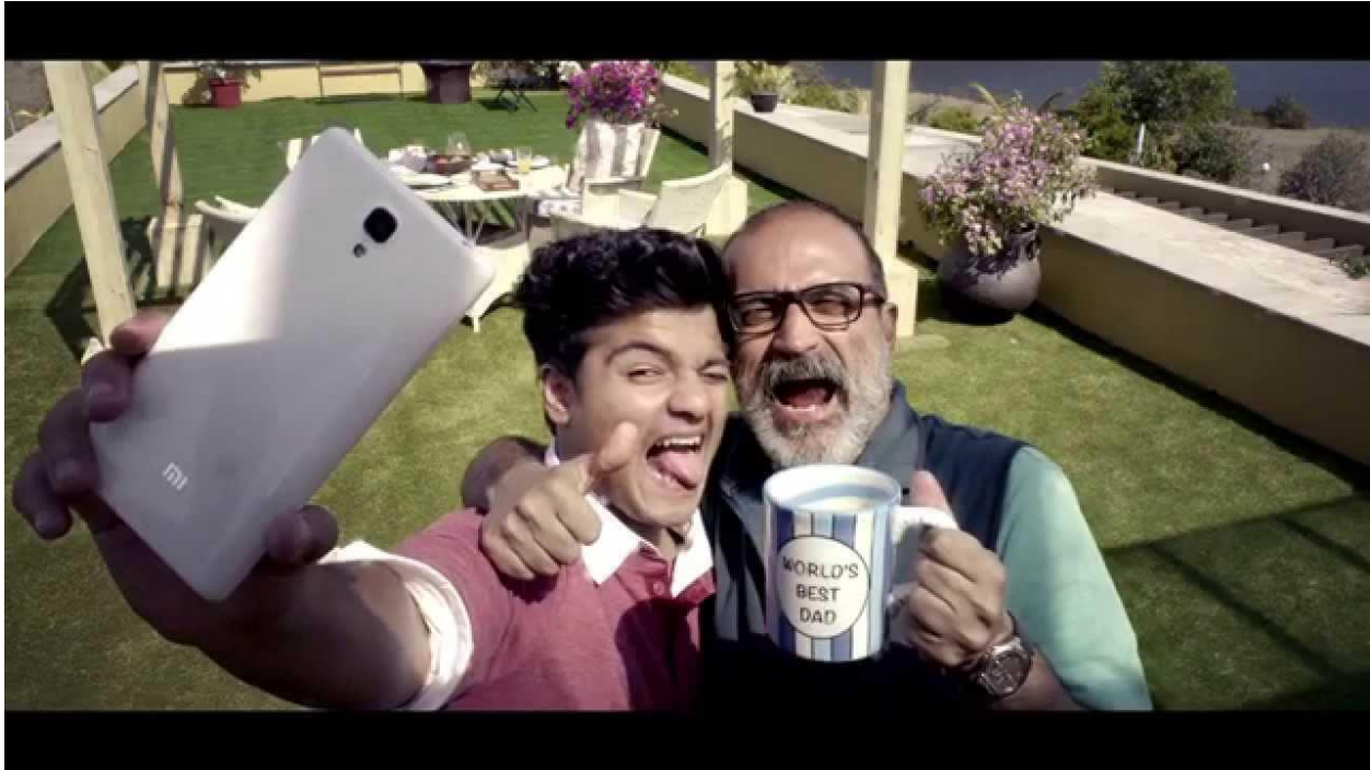
Airtel Ad: Scene 2