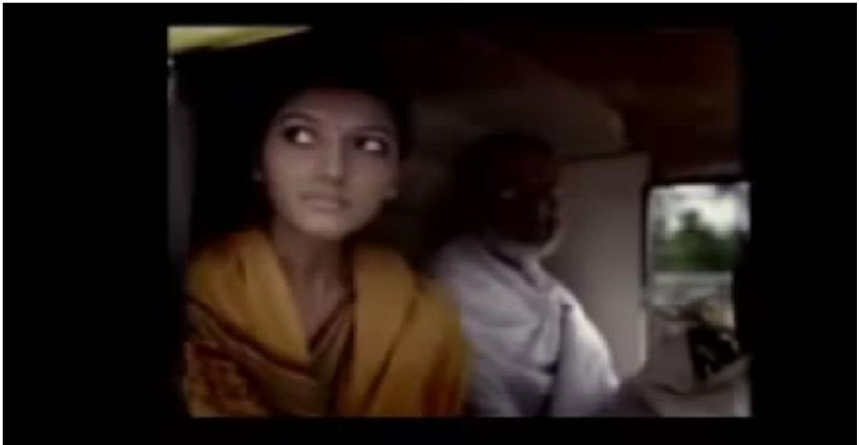
Fair & Lovely Ad: Scene 1

In the 2 nd ad of Fair and Lovely, the same things happened again, a girl with dark complexion goes with her grandfather to an office and everyone makes fun of her because of her dark complexion. She only faces rejection and humiliation just because of her dark skin. And then her grandfather gave her fair & lovely, after using that she became beautiful she got the job and became a star.