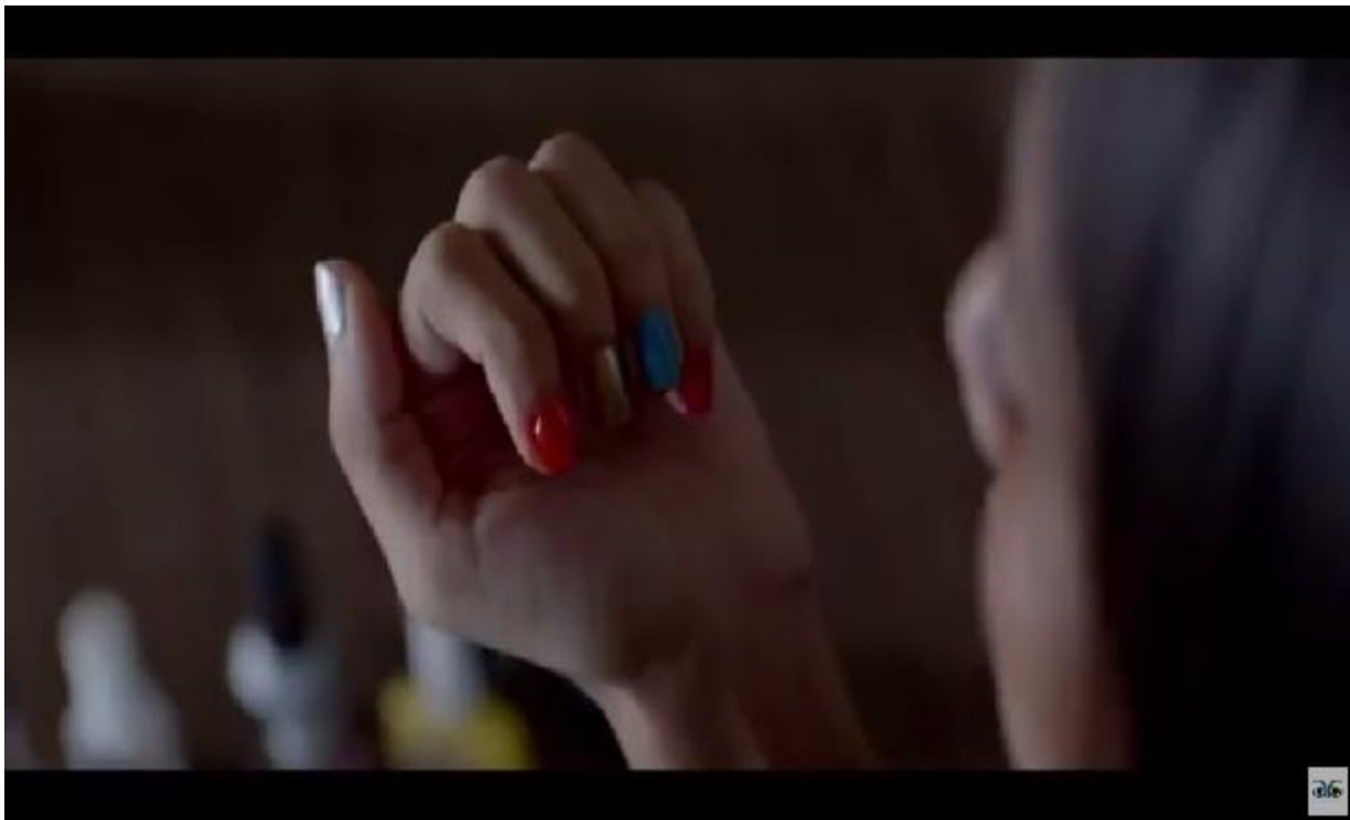
Airtel Ad: Scene 5