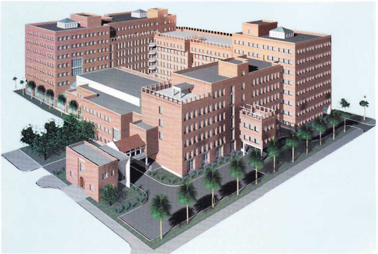
SKY VIEW OF EWU CAMPUS